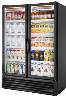
Standard Black Exterior