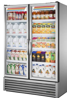
Optional Stainless Exterior