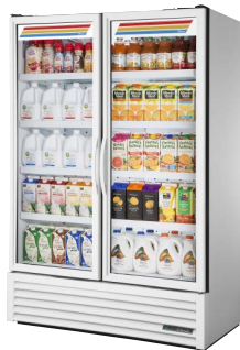
Optional White Exterior