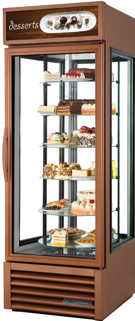
Shown with optional Dessert Sign.

Swing Door Rotating Glass Shelf Refrigerator with Hydrocarbon Refrigerant~True Standard Look Version 01