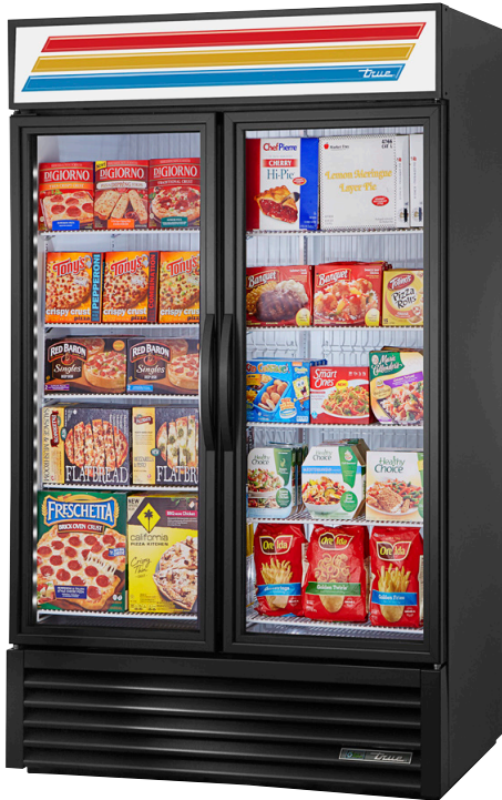
Standard White Interior

Swing Door Slim Line Freezer with Hydrocarbon Refrigerant~True Standard Look Version 01