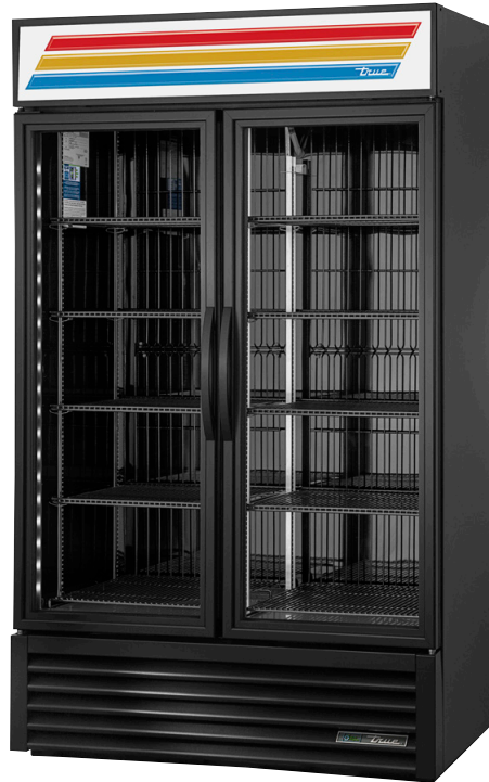
Optional Black Interior