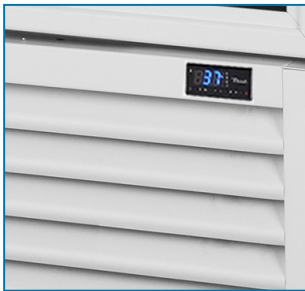
Optional: Display in Grill. Must be indicated at time of order.