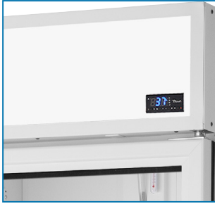
Standard: Display in sign frame.

Swing Door Scientific Refrigerator with Hydrocarbon Refrigerant~True Standard Look Version 01